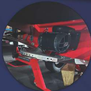
CENTURION SUPREME BOATS