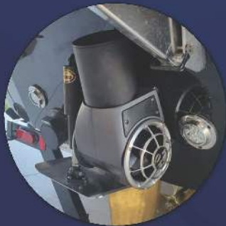
heyday WAKE BOATS