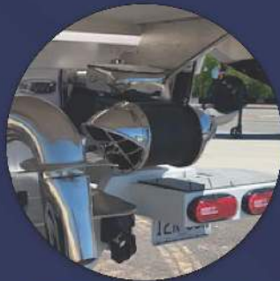
MOOMBA BOATS SUPRA BOATS