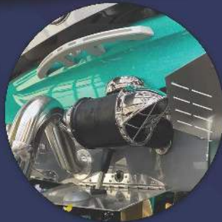
tigé BOATS ATX SURE BOATS